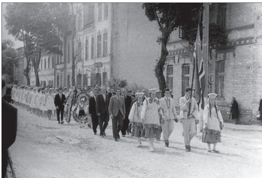
Figure 3. The Festivity of Majority in the Council of Bērze Village in 1964. E 28 10236.