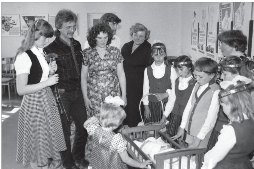
Figure 1. Issuing the birth certificate in the district of Daugavpils / Krāslava in 1983. E 57 156.

Long debates and numerous pilot projects introduced the Festivity of Childhood 50 (see Figure 2) – the initiating ritual of a child into a collective – and ensured that this festivity became an integral part of the agenda of the local executive authorities. The next cycle of life in the system of invented Soviet traditions was the Festivity of Majority (see Figure 3), whose origins can already be observed in the Latvian SSR in the mid-1950s. It had to become an alternative for the Christening of the Lutheran Church. In the 1960s, as attested by the materials of the REM, the Festivity of Majority was celebrated in the entire territory of the Latvian SSR. The ritual of this festivity included the following elements: a pre-festive cycle of seminars, procession to the local Lenin